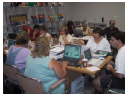
Newmarket Fathom Workshop participants in the workshop room at Spectrum Educational. Note the Apple iBooks, kindly loaned by Apple Canada. Participants braved the workshop just as power was beginning to return.