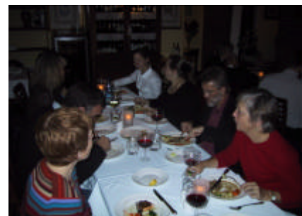
Dinner Monday evening was sponsored by Key Curriculum Press. Pre-dinner wine tasting was sponsored by Spectrum Educational.